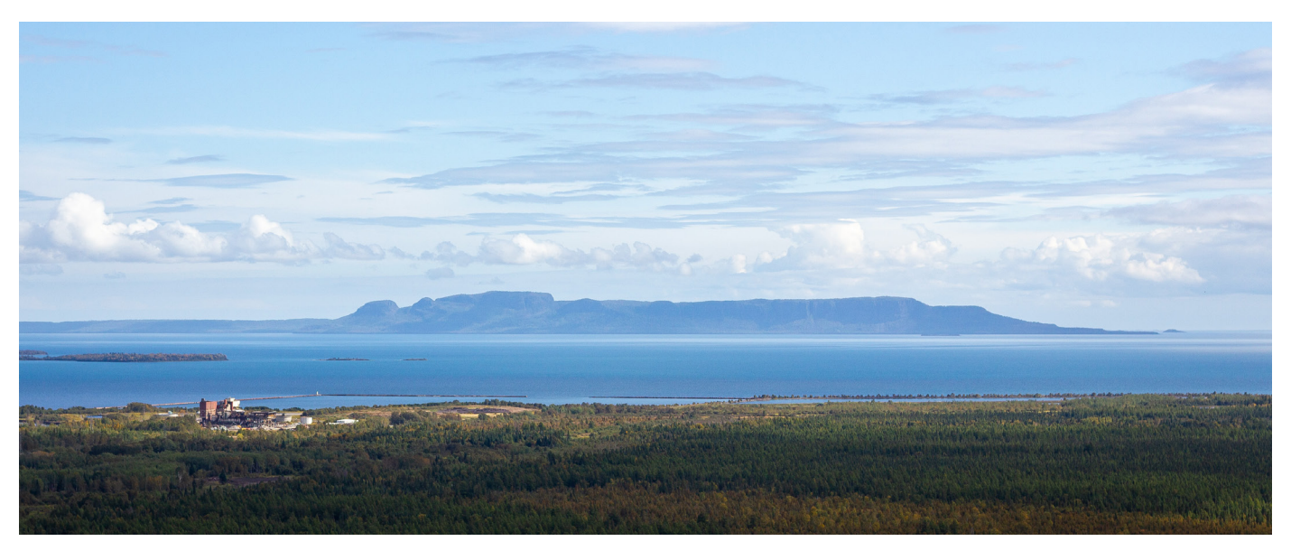
Birds eye view of The Sleeping Giant as seen from the top of Mt McKay (Thunder Mountain).

"St.Joseph's Care Group wishes to acknowledge this sacred land on which our many sites operate here in Thunder Bay. This land has been the territory of the Anishinaabek Nation, and is home to the Robinson Superior Treaty of 1850 territory. We acknowledge the people of Fort William First Nation, situated next to Mount McKay*. Today, Thunder Bay is still home to many Indigenous Peoples from across Turtle Island and we are grateful to have the opportunity to work together in this community and on this territory." *If you are comfortable with the pronunciation, you can note that Mount McKay was originally called Animikii-wajiw (Thunder Mountain).